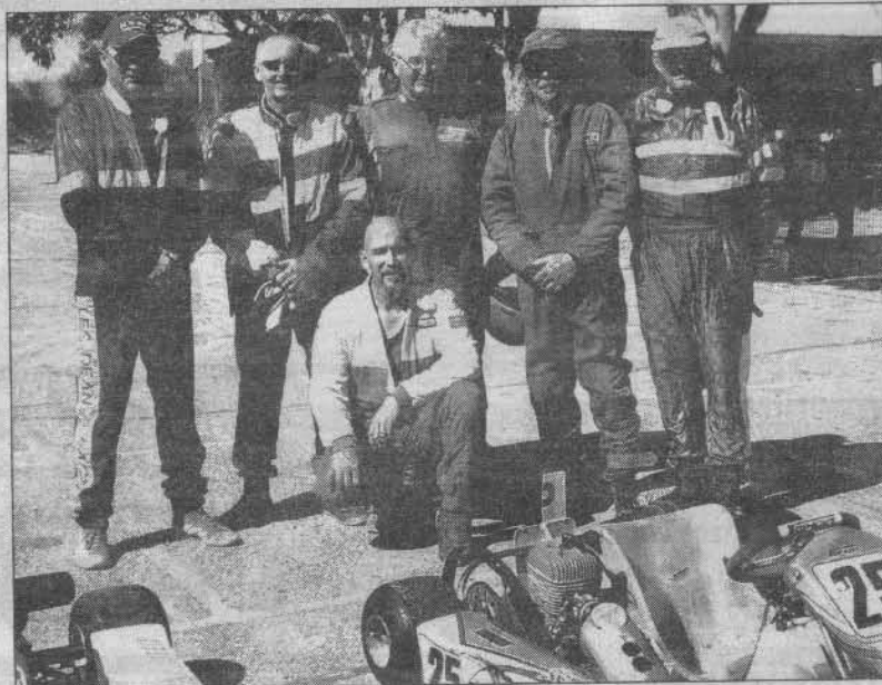
Some of the 'Over 50 Js' at Cockburn Raceway.

The reason is to foster good inter-club relations as well as providing some extra variety of tracks for the